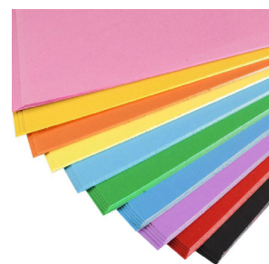
PB405 Coloured Card Assortments - 230 microns