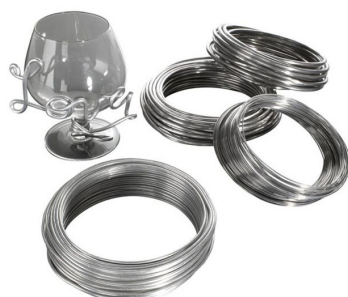
MT880... Soft Aluminium Wire