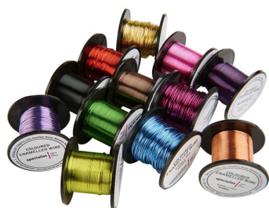
MT964A... Coloured Enamel Wire 0.5mm x 25m reels