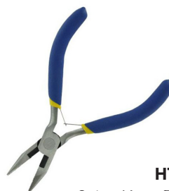
HT913 Snipe Nose Pliers